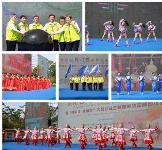
Photos of Theatrical Programs in Shenyang