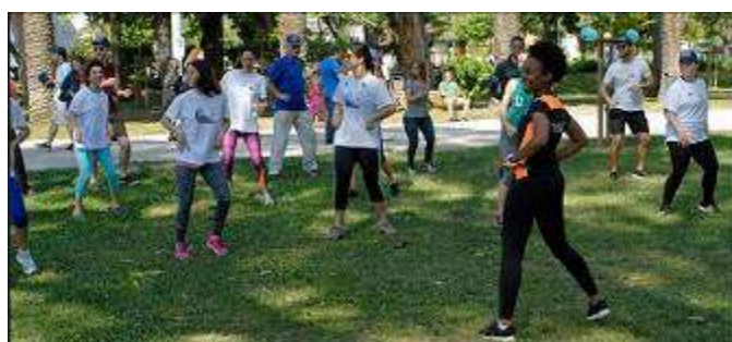
Photo 1: North Portugal activities. Photo 2 Lisbon exercise promotion

In almost every district of Portugal there was a group of energetic family doctors and Family Medicine residents in contact with the population, manly in public spaces like parks, markets, sport arenas, etc. Track walks, bicycle tours, fitness and zumba classes were some of the most popular events across the territory and at the end, in practically every situation, there was a stand with useful information (in the form of leaflets, brochures, info cards,