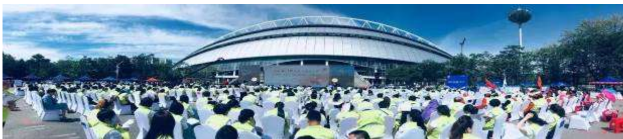
Photo of the main venue of Shenyang