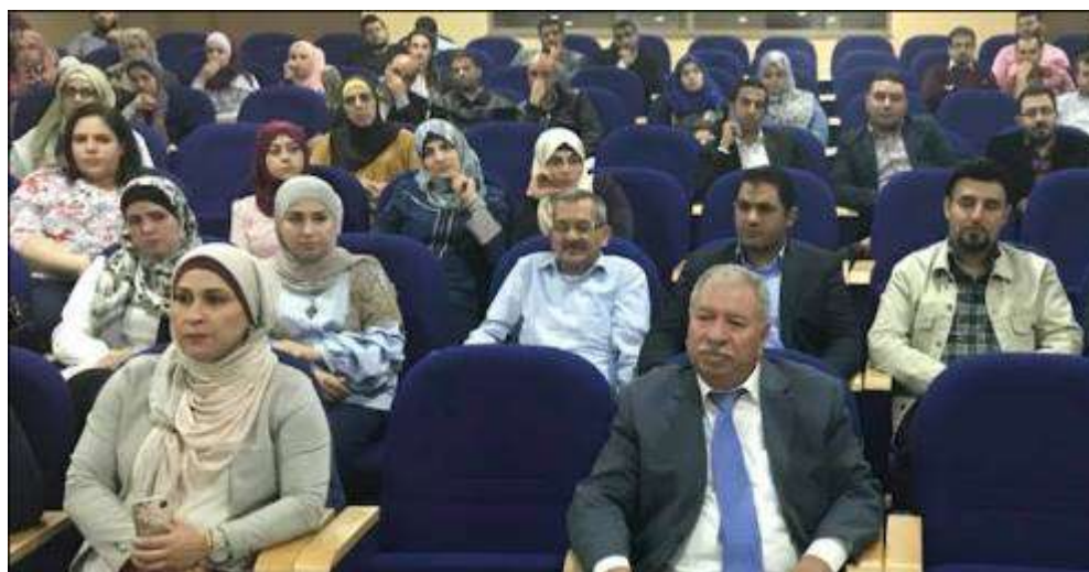
Photo at right- scientific activity.